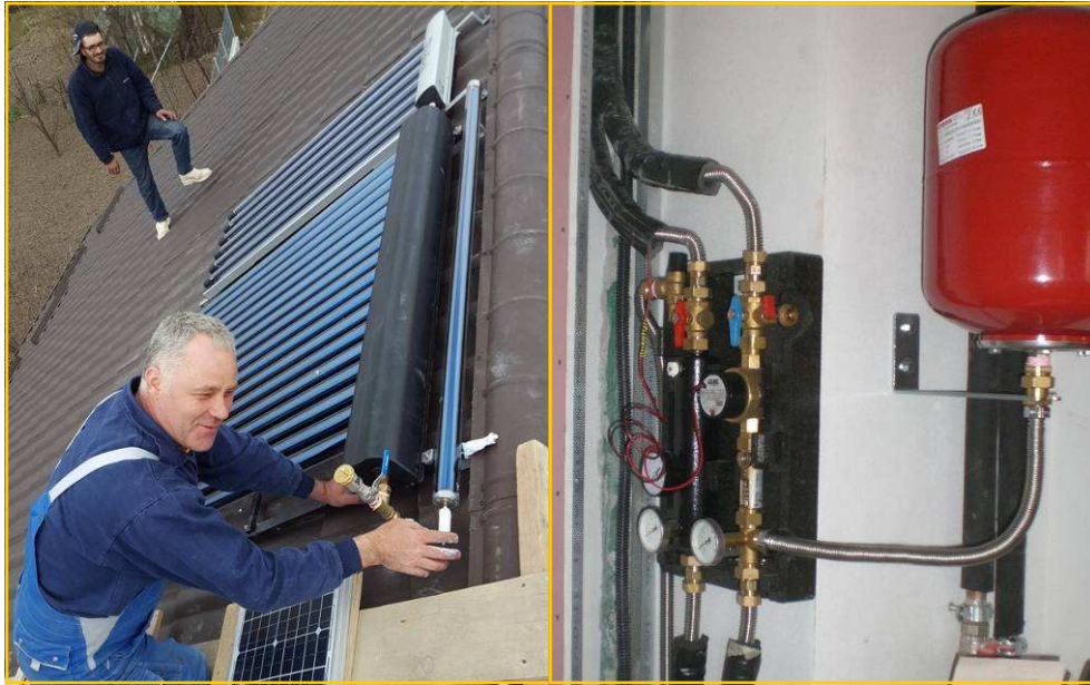
Romania's summer weather is ideally suited to the use of solar energy. This roof-top installation is already proving hot water at 70C.