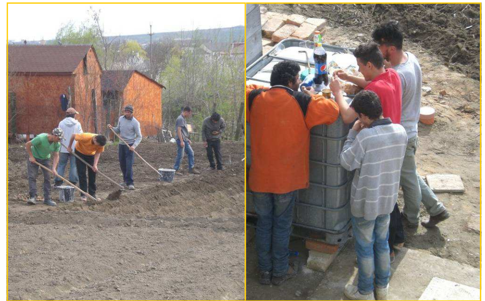
The land around the house is used for growing vegetables. The young men are encouraged to be actively involved and learn new skills as gardeners.