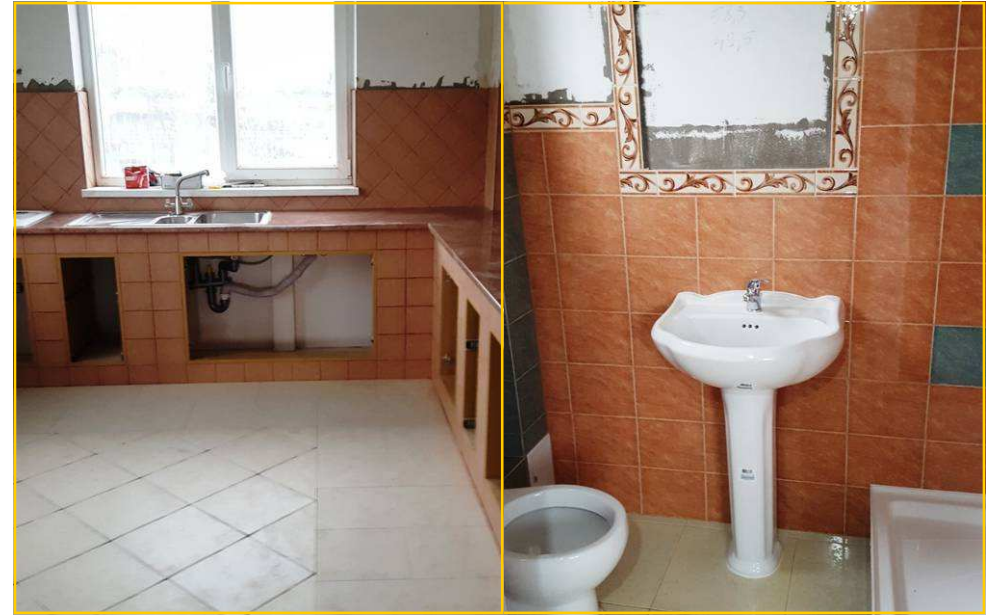
The kitchen and the bathrooms are being decorated using tiles and sanitary ware donated by organisations in the UK.