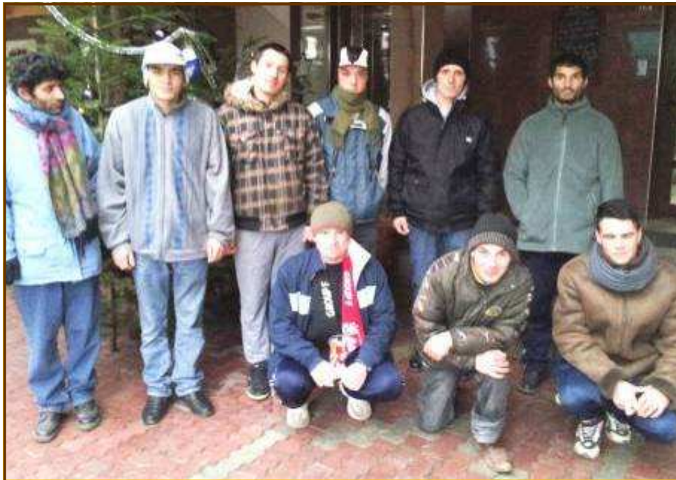
Some of the young men who might be candidates for a room in the new house - but no promises yet!

Although it is intended that the residents will be largely self-sufficient, there is a need for someone to take responsibility for ensuring the proper care and maintenance of the property, and to ensure that they abide by such rules as are necessary. Such a person will need skills in managing inter-personal relationships and be able to encourage the residents in the development of their social skills. In terms of accommodation, the building has provision for an administration office on the ground floor and a large apartment in the roof space. The selection of a suitable manager will be a major factor in the success of the project - the most likely candidate is someone with pastoral experience and a motherly wife!