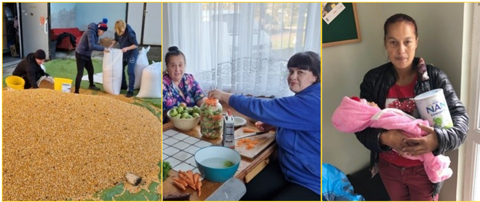
The Romanian Aid Foundation and Asociația Neemia